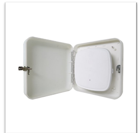
With Cisco Catalyst 9130AX