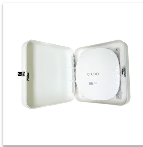
With Aruba AP-555